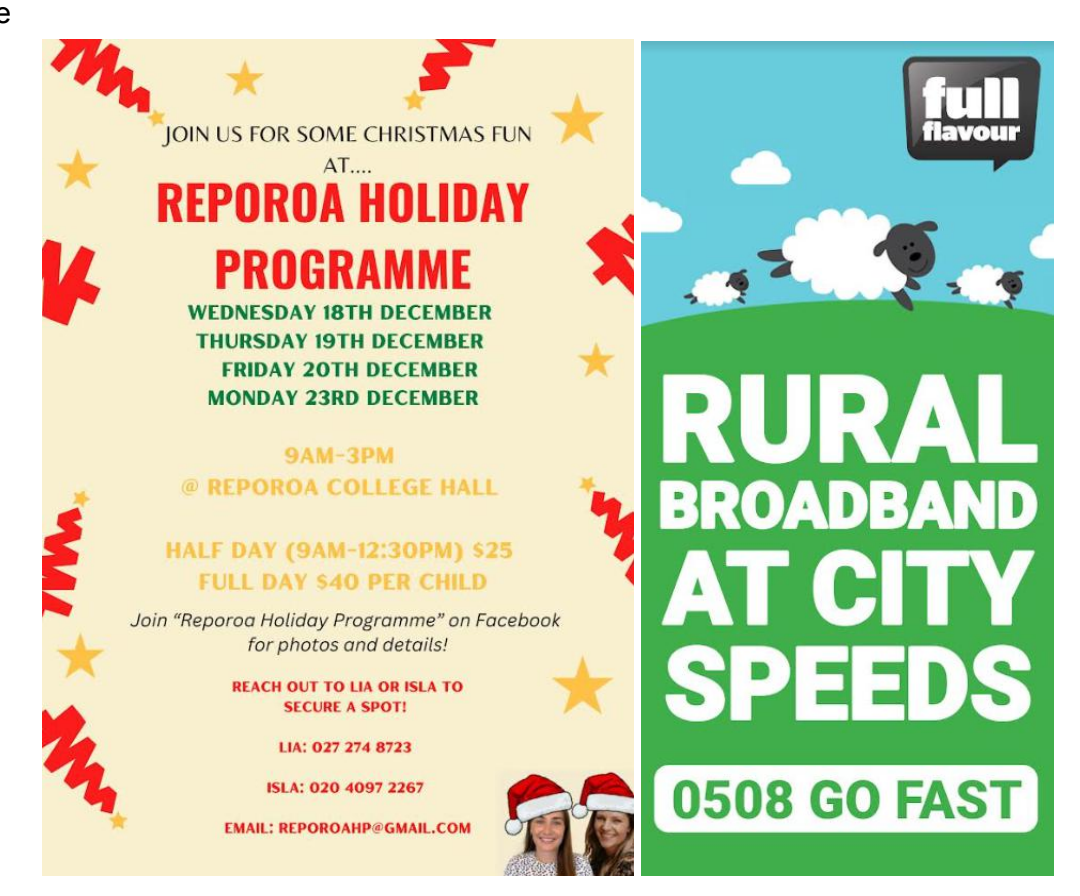
Ka kite ano