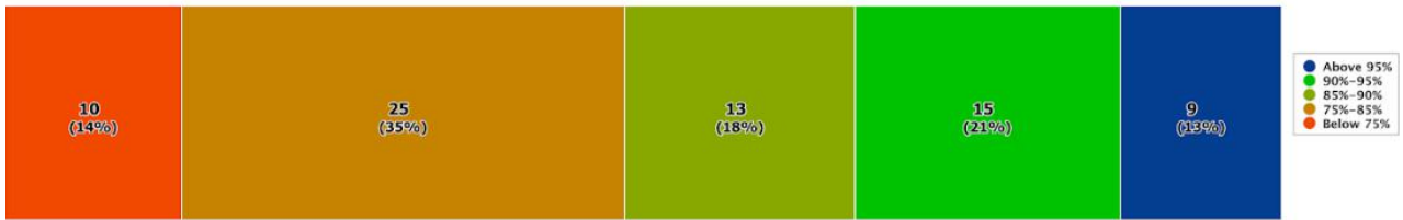
Attendance Data (5 Point Scale) Term 2 - 2024 - 100% Bar Chart